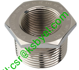
Type BB Hex