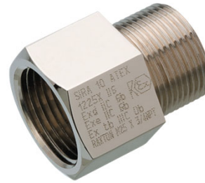
Type AB Hex

Raxton adaptors and reducers are marked with the applicable approval number and size.